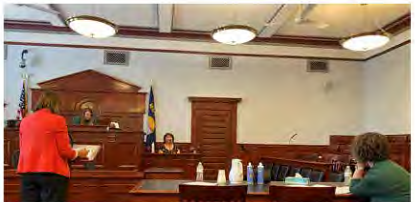
Little Shell Tribal Councilwoman Iris Killeagle provides QEW testimony during a mock training held in the Great Falls courtroom.