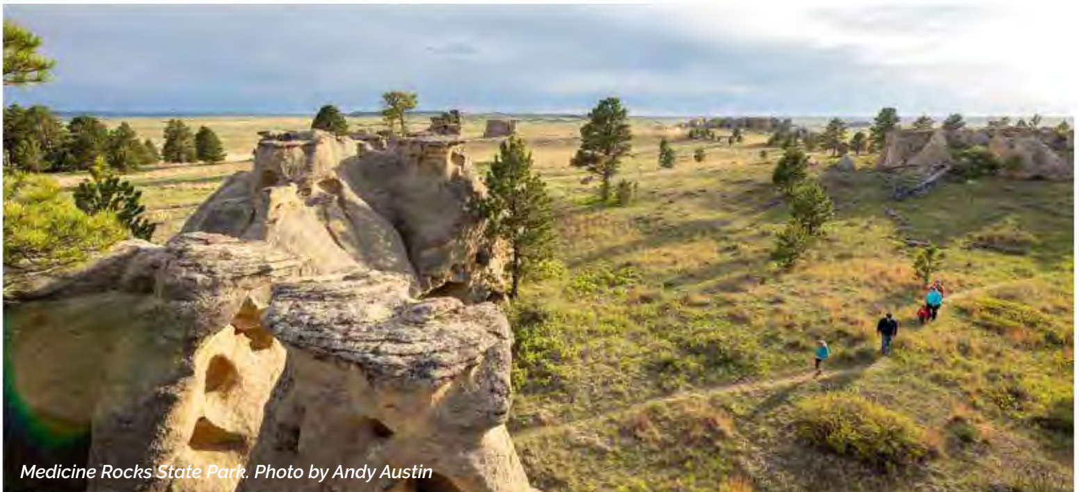
Medicine Rocks State Park.

The program offered up to $6,250 in grant funds for Native American-owned, tourism-related small businesses to invest in website development or improvements, enhanced professional content, and engaging virtual experiences. A total of $86,500 was awarded to 14 Native entrepreneurs running a variety of business ventures, including gift shops, food service, guided tours, and outdoors/recreational activities. Operations like De Boo's Ranch Adventures (Blackfeet), Native Country Tourism in Ashland (Northern Cheyenne), and Bishop Guide Service (Fort Belknap) capitalized on these funds to develop stronger marketing assets, better promote their businesses, and sell directly to customers online.