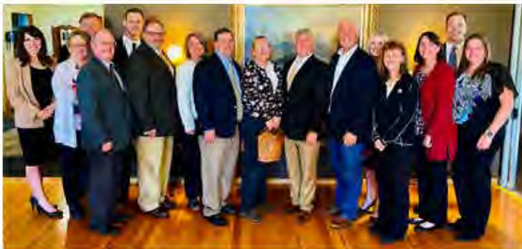
Gov. Gianforte, Commissioner Downing, and CSI staff.

As a consumer protection agency, the Office of the Commissioner of Securities and Insurance (CSI) investigates and prosecutes bad actors who take advantage of consumers. Under Commissioner Troy Downing's leadership, the agency is increasing the availability of educational resources and training opportunities to raise consumer awareness and enhance prevention efforts with the general public and targeted groups, including Native Americans.