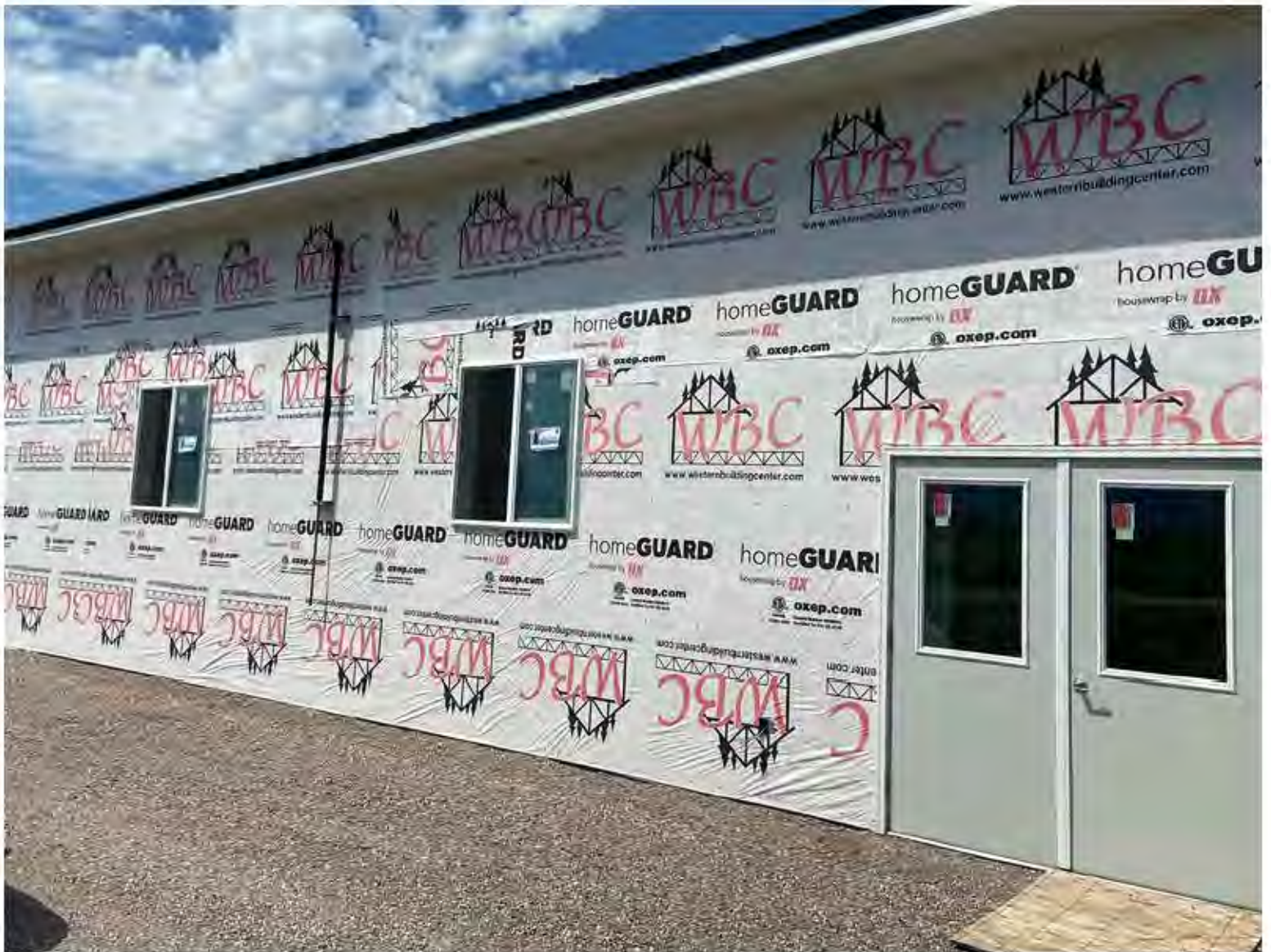
The construction is near completion on H and D Meat Processing's new facility funded in part with the Department of Agriculture's Montana Meat Processing Infrastructure Grant program.

supported the creation of a local grass-fed beef food chain that provides reasonably priced beef to the Northern Cheyenne Nation, while relying on tribal and other local ranchers within a 50 miles radius of Lame Deer.