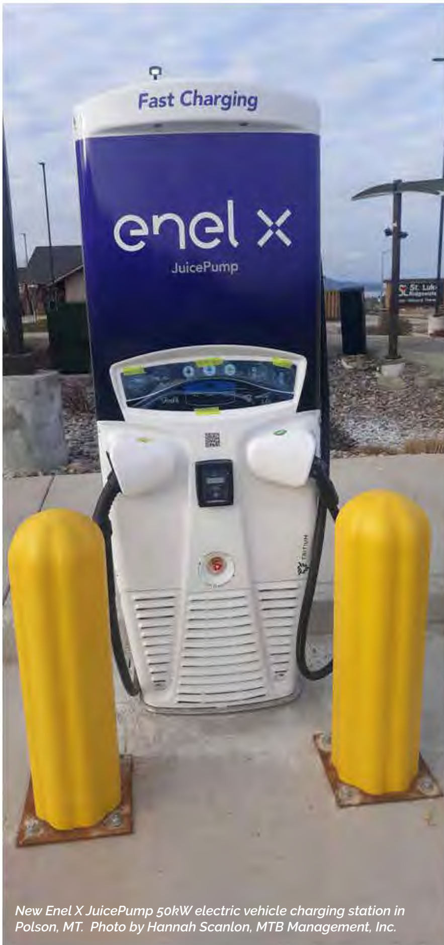
New Enel X JuicePump 50kW electric vehicle charging station in Polson, MT.

I-94, U.S. Highway 2, and the remaining portions of I-15 and U.S. Highway 93. The FHWA's approval makes federal funding available to purchase and install electric vehicle charging stations at locations along the corridors.