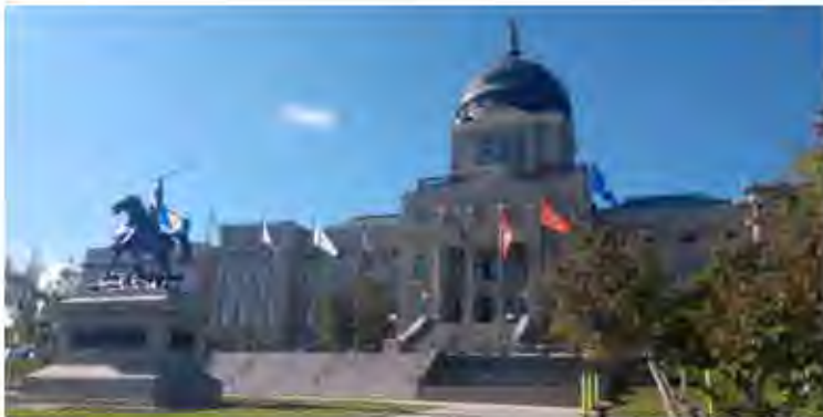
Tribal Flag Plaza.