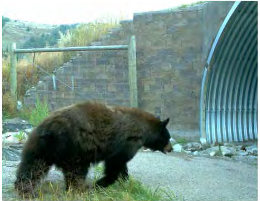
Bear using the tunnel providing safe passage under the highway.

Project design elements are intended primarily to reduce the likelihood of vehicle collisions with grizzly bears, but will benefit other animals including white-tailed deer, black bears, and mule deer. Since 2010, one-third of all documented grizzly bear highway fatalities in the Northern Continental Divide Ecosystem have occurred on US 93 from St. Ignatius to Ronan. The project is located along US 93 (N 5) in the St. Ignatius area beginning approximately two miles south of St. Ignatius and ending approximately two miles north of St. Ignatius, spanning nearly 5 miles. The project is approximately 30 percent through the design phase and projected to cost $1.5-2 million.