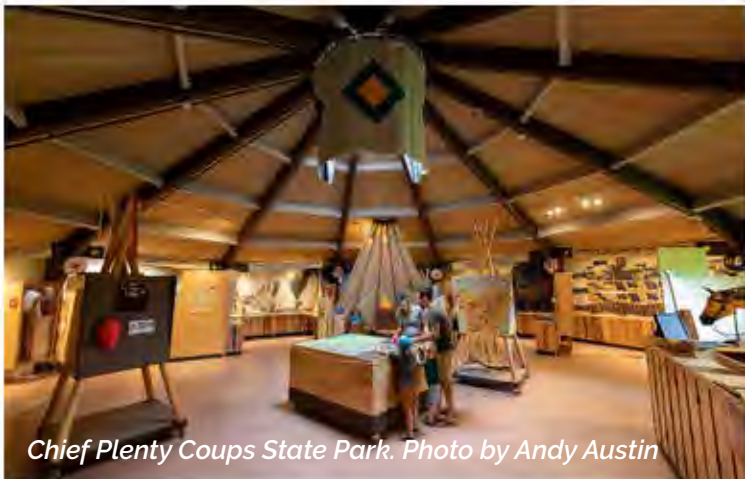
Chief Plenty Coups State Park.

OICED is also building a partnership between Montana State Parks, the Crow Nation, and the Northern Cheyenne Tribe to enhance first-voice interpretation of Native American-themed state parks in Montana. This pilot project will generate videos for the Chief Plenty Coups, Pictograph Cave, Medicine Rock, and Rosebud Battlefield state parks that provide the Native perspective regarding these sites.