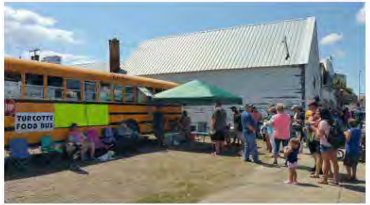
Turcotte Food Bus, a Montana Indian Equity Fund Small Business Grant recipient, is a popular food service business in the Fort Peck Reservation area.