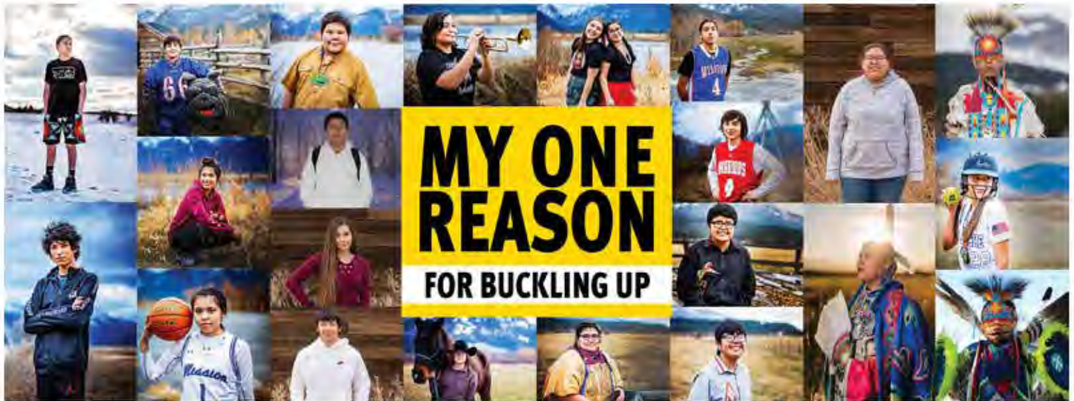
Safe On All Roads (SOAR) Teen Buckle Up Campaign in tribal communities lunched from February 2021 to June 2021.

MDT funds are provided to Tribal Law Enforcement agencies for high visibility enforcement activities through the Selective Traffic Enforcement Program (STEP). In the last fiscal year, MDT's State Highway Traffic Safety Program provided $404,219 to support these efforts.