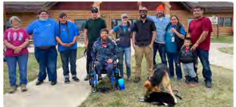
Volunteers, interns, college students, BCC staff, and DNRC staff after successful tree planting and activities at Earth Day/Arbor Day Celebration.