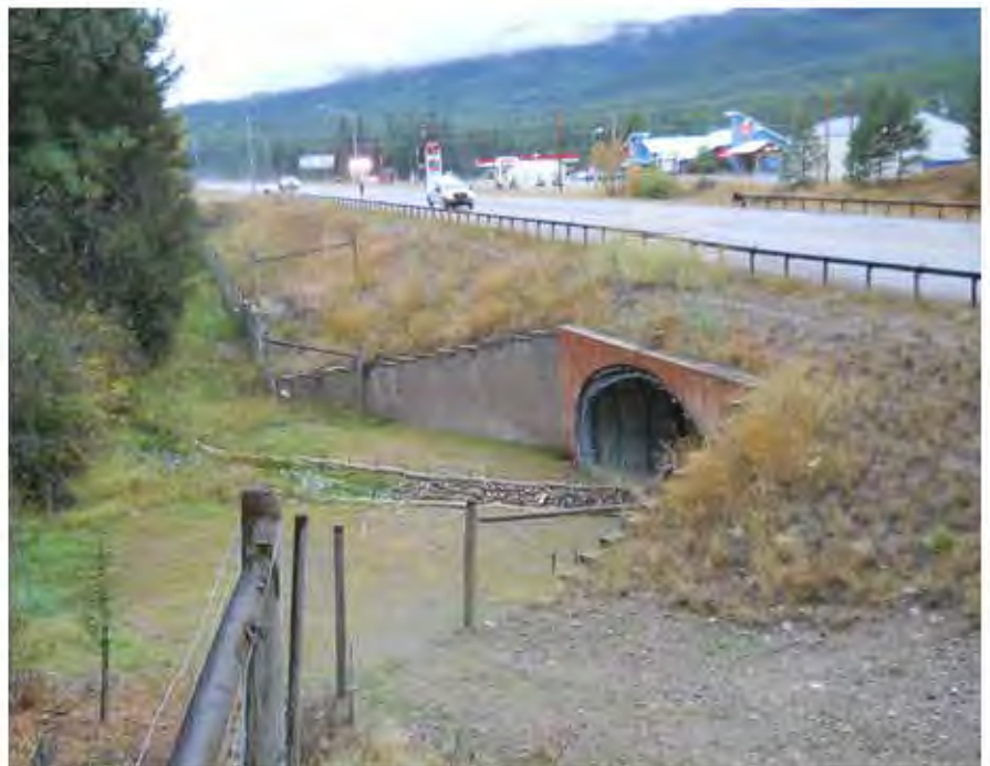
Fencing and tunnel guiding wildlife passage under Highway 93 on the Flathead Reservation.