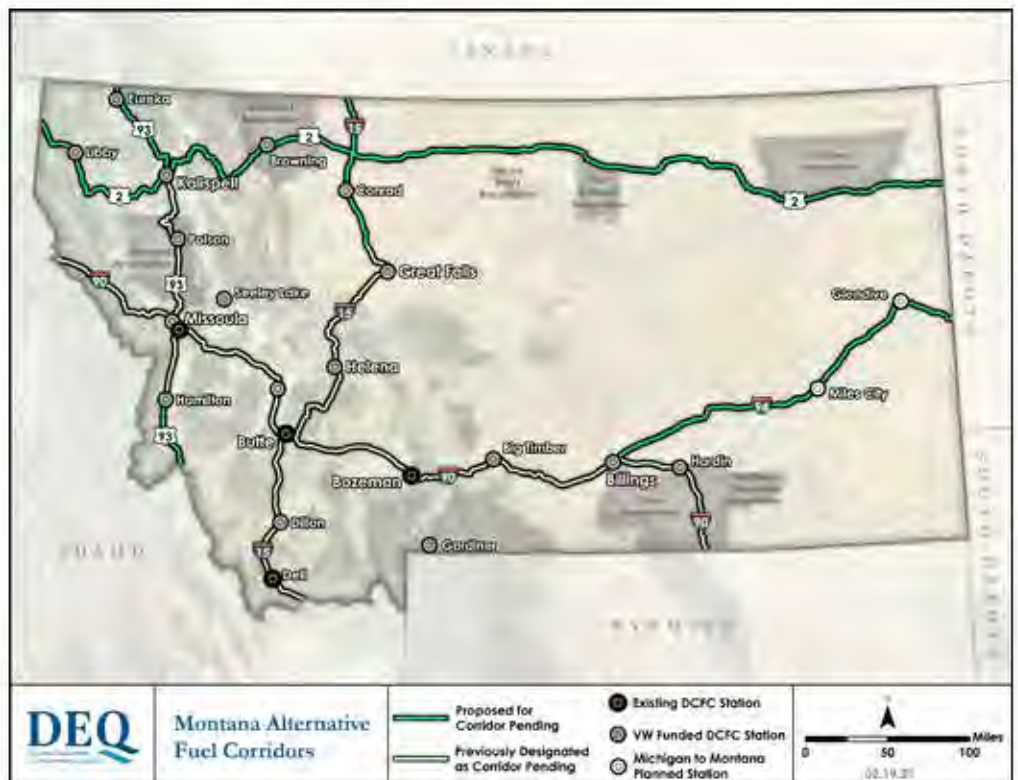
State of Montana's Alternative Fuel corridors map.

The State of Montana has joined a national effort to establish a network of Alternative Fuel Corridors for alternative fueling and electric vehicle charging infrastructure along designated highway systems. In 2020, the Federal Highway Administration (FHWA) approved the first section of Montana's Alternative Fuel Corridors encompassing I-90 and portions of I-15 and U.S. Highway 93. In the spring of 2021, the Montana Department of Environmental Quality (DEQ) proposal to expand the corridors to cover the northern and eastern parts of the state was also approved, which added