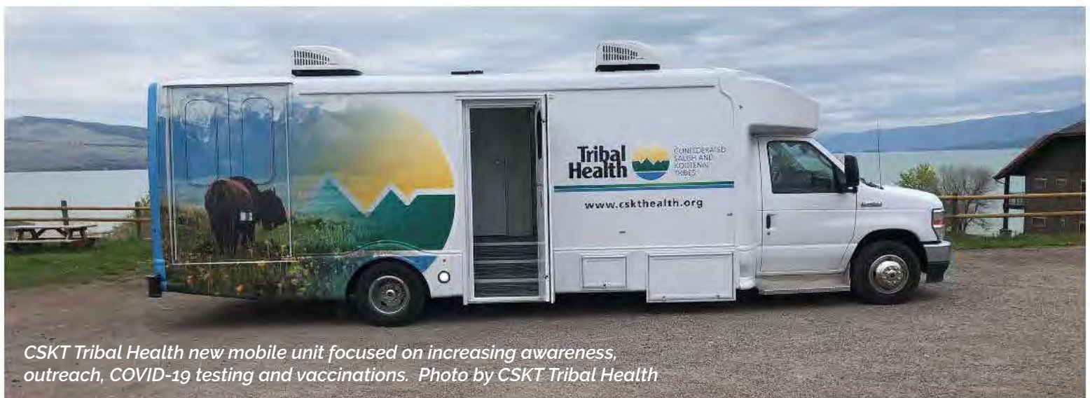
CSKT Tribal Health new mobile unit focused on increasing awareness, outreach, COVID-19 testing and vaccinations.

The most recent surveillance report from the Centers for Disease Control and Prevention indicates that mortality due to COVID-19 is 2.2 and 3.8 times more likely to occur among AI/AN persons than among white persons. These findings reiterate the importance of mitigation strategies that tribal communities implemented to prevent COVID-19, as well as the governor's decision to prioritize AI/AN persons for receiving COVID-19 vaccinations.