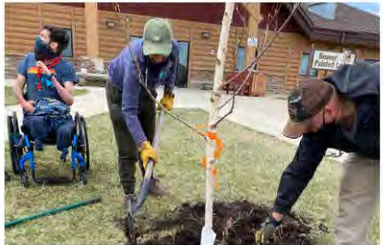
Instructors with the horticulture program and a college intern planting trees on the BCC campus.

The program also took on the National Association of State Foresters (NASF) centennial challenge by committing to supply at least 100 trees throughout tribal communities, with projects on the Fort Belknap, Blackfeet, and Flathead reservations. The program surpassed this goal and supplied over 400 trees. The program is also providing continued business and technical support for interpretive, educational area design for more trees and culturally significant and native plants.