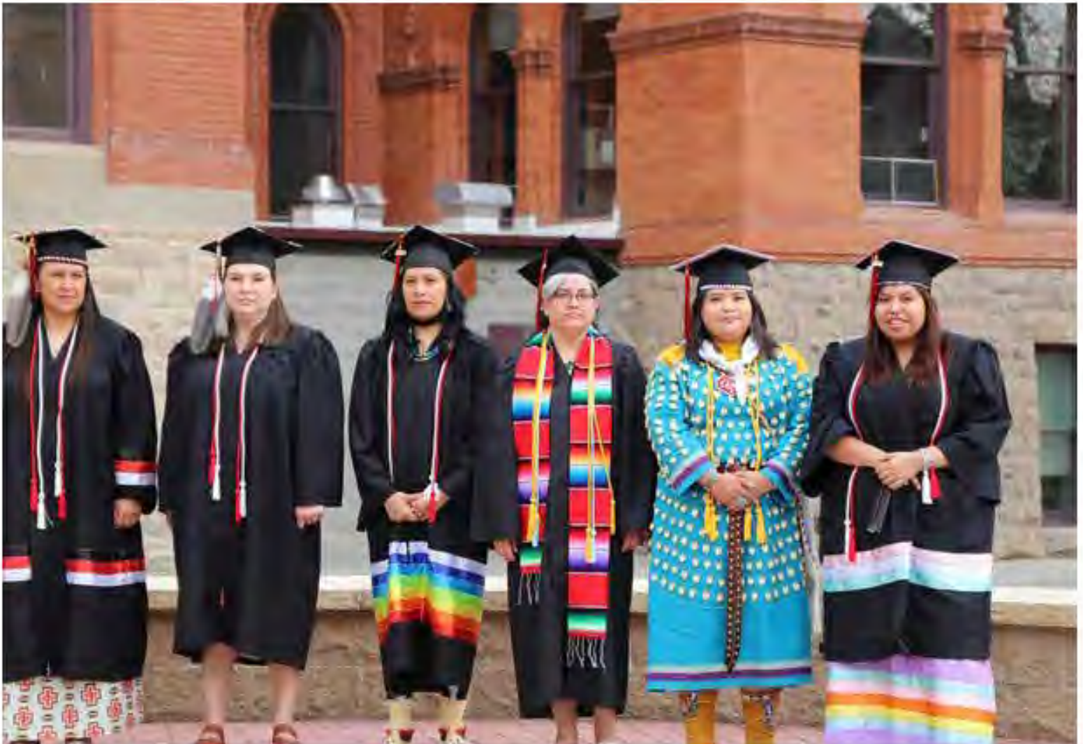
2021 graduation ceremony.

The project supports 21 Native American students seeking B.S. degrees in early childhood education through an innovative, culturally responsive online program. Participating students are completing courses using a cohort model with the assistance of a mentor. The project has exceeded the targeted enrollment number for the grant, which is a significant accomplishment given the challenges of recruiting during the pandemic.